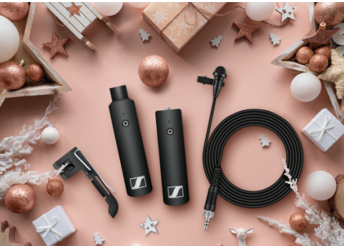
Delight the filmmaker in your life with the gift of outstanding audio

Marlow/UK, 27 October 2020 – Can't see what to buy for the filmmaker in your life? Forget 8K and 4K, or gizmos and gimbals, with even consumer cameras offering exceptional high-quality video, it's what we hear that adds a professional gloss of realism and impact to video content. No matter if they're taking their first steps in vlogging or bringing broadcast-quality footage to a global audience, this holiday season, audio specialist Sennheiser will help you give the filmmaker in your life the magic of sparkling audio.