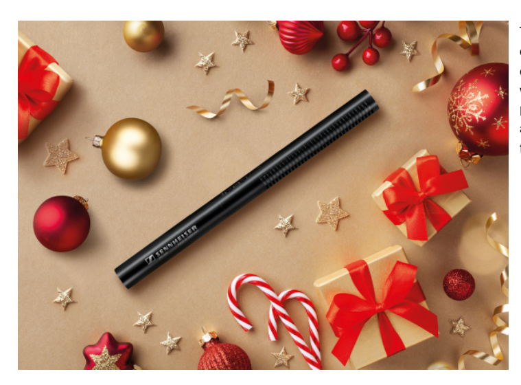
The MKE 600 delivers outstanding performance even in demanding filming situations, with a super-cardioid pick-up pattern that offers maximum attenuation of unwanted noise from the sides

When shooting wider shots or using longer focal lengths, you often need the creative freedom to place the camera further away from the subject. This is where Sennheiser's MKE 600 shotgun microphone excels: its distinct (super-cardioid/lobar) pick-up pattern ensures outstanding performance even in demanding filming situations and maximum possible attenuation of unwanted noise elements from the side. As a versatile tool ready for virtually any professional challenge, you can combine the MKE 600 with either an XLR or a mini-jack cable (please order separately). A hairy cover is available too when filming outdoors.