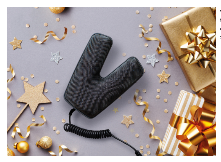
With its dual mini shotgun mics, the Sennheiser MKE 440 delivers picture-perfect, natural stereo sound

Sennheiser's <u>MKE 440</u> stereo camera microphone delivers picture-perfect stereo sound – it captures sound from the subject with clarity while still retaining a pleasant level of ambient sound for atmosphere. With two matched shotgun microphones in a V-shaped configuration, it acoustically covers a stereo width equivalent to a 35mm camera lens – so you can hear what you see – without distractions from off-axis sounds.