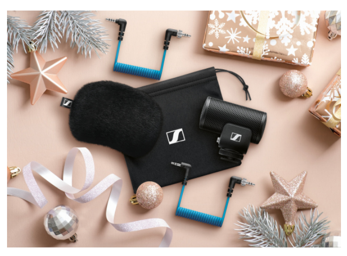
Rugged and sleek enough for DSLRs, DSLMs or phones – the MKE 200 from Sennheiser is an ideal take-anywhere audio upgrade

Quality video is easy to come by these days, but that isn't always the case when it comes to quality audio. Even the phone in your pocket has the ability to shoot video in crisp 4K resolution, so why shouldn't it sound as good as it looks? This is where an external microphone such as Sennheiser's new MKE 200 microphone comes in.